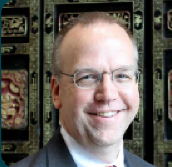
GREGORY W. BAKER RENAISSANCE CHARITABLE FOUNDATION, INC